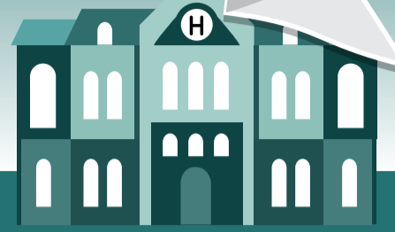
HIGH SES School Websites