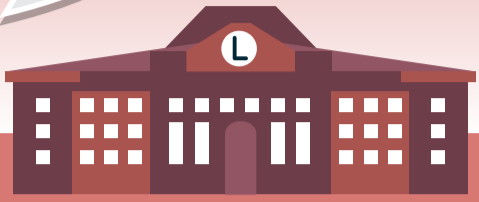
LOW SES School Websites

Limiting 'literacy' to reading and writing has been a major cause of 'educational lockout' for many Australian students. In contrast, research suggests superior educational outcomes are achieved by teaching multiple literacies utilising many sensory modes. To determine Victorian Secondary school 'literacy values' a mixed method study was used to compare literacy language (specifically 'Conventional' & 'Digital') on LOW & HIGH Socio-economic status (SES) school websites.